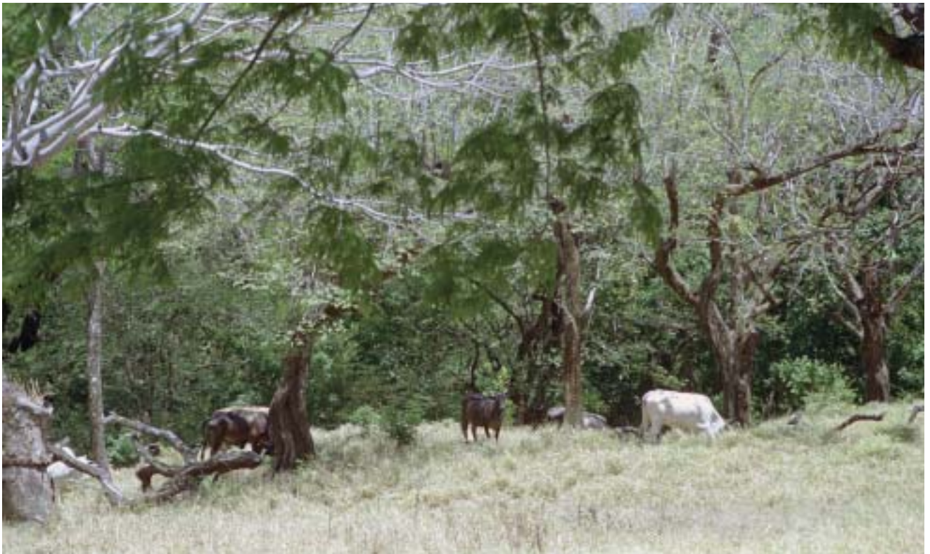
Photo 1 — Silvopastoral systems, in which pastures include significant tree cover, tend to be more productive and to provide a much better habitat for biodiversity. Here, cattle graze in pastures with high tree cover in Esparza, Costa Rica.